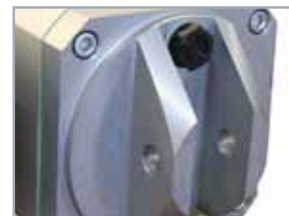
Back flange in solid machined aluminium