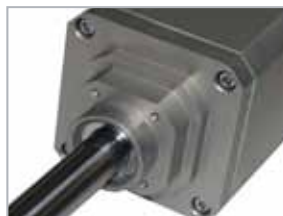
Front flange in solid machined aluminium