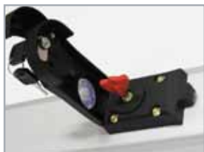
Release system protected by metal lock with release key at the inside