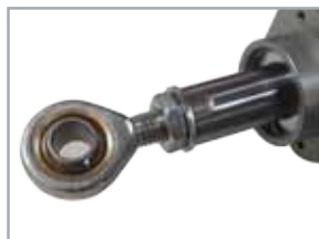
Round joint for stroke adjustment